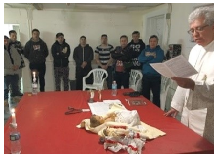
Mass in Martin's Camp, Celebration of the Divine Child Jesus

✧ Each person in Latin America knows the delicate and tender presence of the Virgin of Guadalupe. In a unique way, migrant families and communities experience her maternal closeness. They recognize her on all roads and see her in all circumstances, even when the circumstances are most difficult. In the month of December, the image of Our Lady of Guadalupe will bring us all together, to sing with her and remember that, in her heart and under her care, the poorest will always find a place. ✧