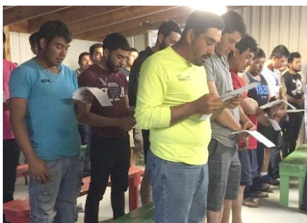
Workers in Cayuga County, Mass in King Ferry