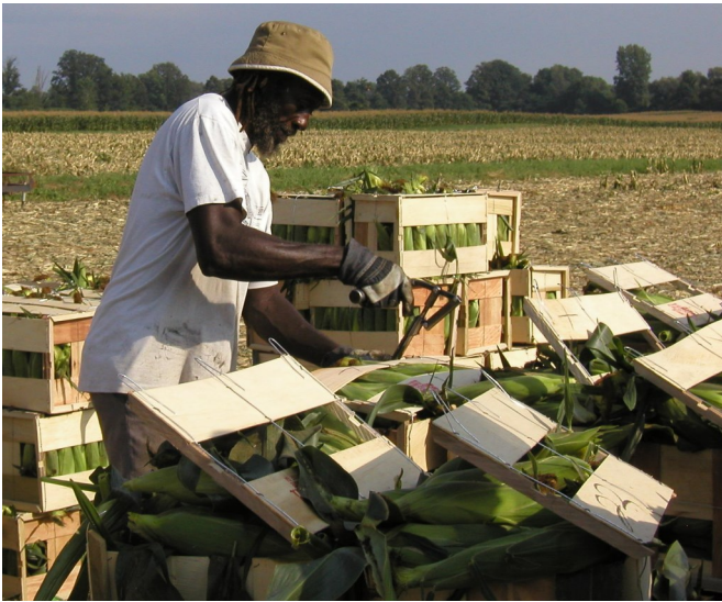
Harvesting sweet corn in Cayuga County